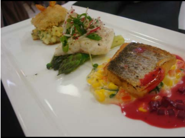
CHEF GOULET'S GOLD MEDAL WINNING BRONZINO THREE WAYS